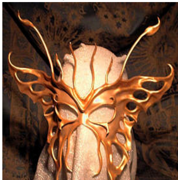
CARNIVAL * MARTEDI GRASSO (Mardi Gras or Fat Tuesday)

Evokes emotions, images, color, Venice. Masks are ageless. They have no gender and no class. Masks are silent too, which makes them even more mysterious. The mask lets you be what you want to be and it's also a representation of yourself. Never take a mask off. You'll surely be disappointed.