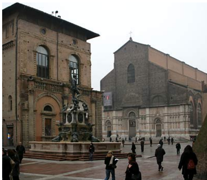
Piazza Maggiore * Neptune Fountain Basilica di San Petronio (rt)