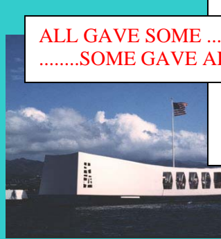
USS Arizona Memorial