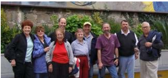
La famiglia - le Memorie MERA VIGLIOSE

I have to add that I can still taste the homemade pastas, various wines without the sulfites, pastries, cheeses and crusty Italian bread; the fresh fish caught daily and homemade sausages and too many dishes to name, gelato, and the best pizza in the world. We arrived home safe and sound, sad to leave our family, but tired and happy to be back in the in the USA. Ciao, Bon Appetito