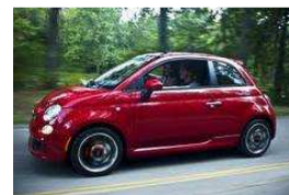
FIAT 500 C