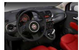
Interior – Fiat 500 C

The USA market will soon see this reborn - FIAT brand. This "Italian Mini-Cooper" will get 30-40 mpg. Just 500 units of the special model will be sold here. The 500 will start at around $15,300: many features are available.