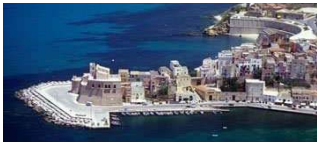
Castellammare Del Golfo