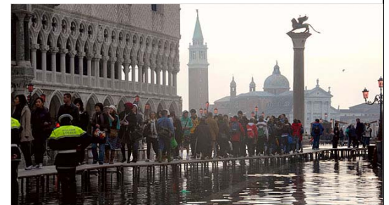
Platforms at Piazza San Marco in Venice as water recedes.