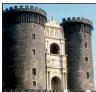
Maschio Angioino In Naples

MAY OF MONUMENTS (Maggio dei Monumenti), Naples; May 2-25; an annual festival with events taking place every weekend where museums and monuments open for free, and there are special cultural activities all around the city. One of the most interesting activities is a series of guided walks through the historic district and the city's underground passages. There are also exhibitions and fairs, chamber music recitals, rock and pop concerts, cinema screenings, operettas, performances of classic Neapolitan songs, soccer matches, horse races, dance spectacles, parties and theatre events. The theme for the 2008 edition is "Art and Culture Itineraries between Naples' Castles and Churches".